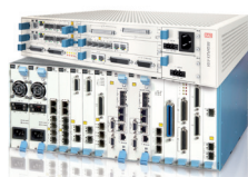
Megaplex-4 Next-Generation Multiservice Access Nodes

RAD is a leader in communications solutions for air traffic control, with large successful ATC projects in China, Colombia, Indonesia, Poland, Sweden, the Ukraine, and other countries. Our Service Assured Networking solutions include best-of-breed tools for cyber security, mission-critical reliability and seamless migration to modern packet switched networks and applications. RAD has more than 30 years of proven experience, a significant worldwide presence in more than 150 countries, and an installed base of more than 13 million units. RAD is a member of the $1.2 billion RAD Group, a world leader in communications solutions.