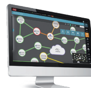
RADview Carrier-Class Network Management System

International Headquarters 24 Raoul Wallenberg Street, Tel Aviv 69719, Israel Tel: 972-3-6458181 | Fax: 972-3-7604732 email: market@rad.com | www.rad.com