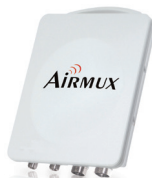
Airmux-5000 Point-to-Multipoint Ethernet Radio