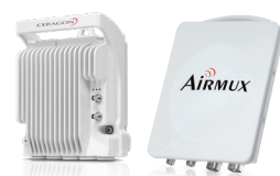
Ceragon/Airmux Wireless Transport Platform