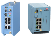
SecFlow Industrial IoT Gateway with Programmable Logic Controller LoRaWAN Server