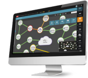
RADview Management and Domain Orchestration