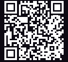
RUTX14 360° VIEW